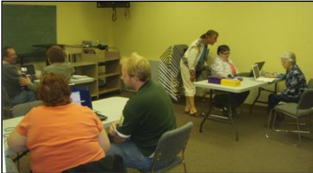
Participants at The Community Learning Place