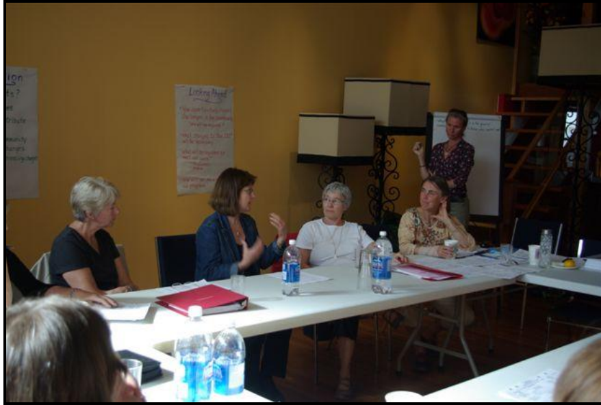
District Literacy Planning Meeting – May 2011