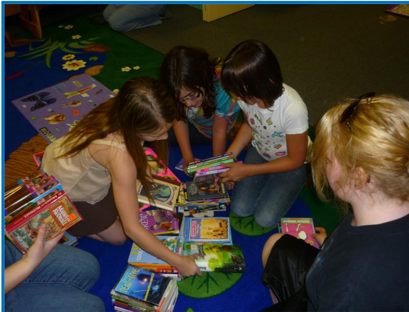
Girl's Eye View Book Give-away