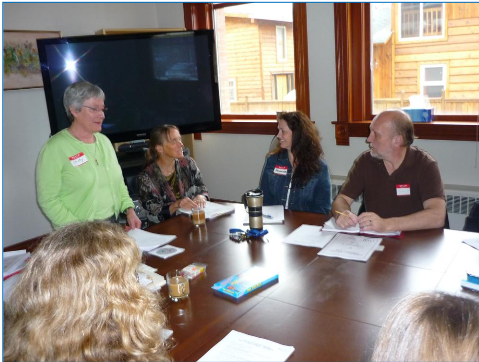
District Literacy Plan Meeting - April 2010